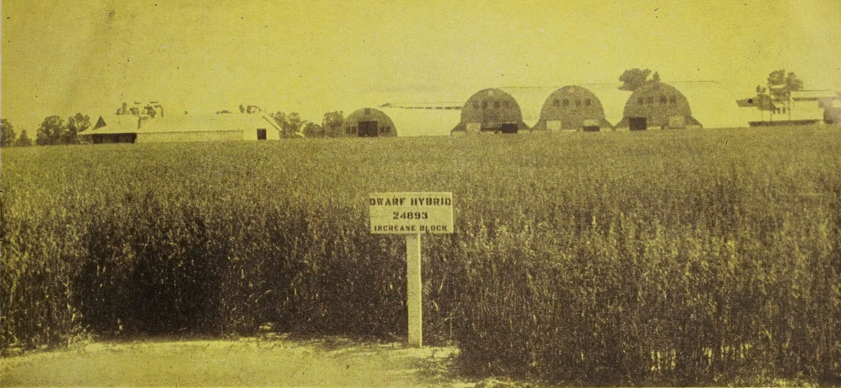
Scene above shows a small increase field of one of the new varieties which are being perfected for release to the commercial trade within the next few years.